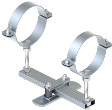
Type 118 C